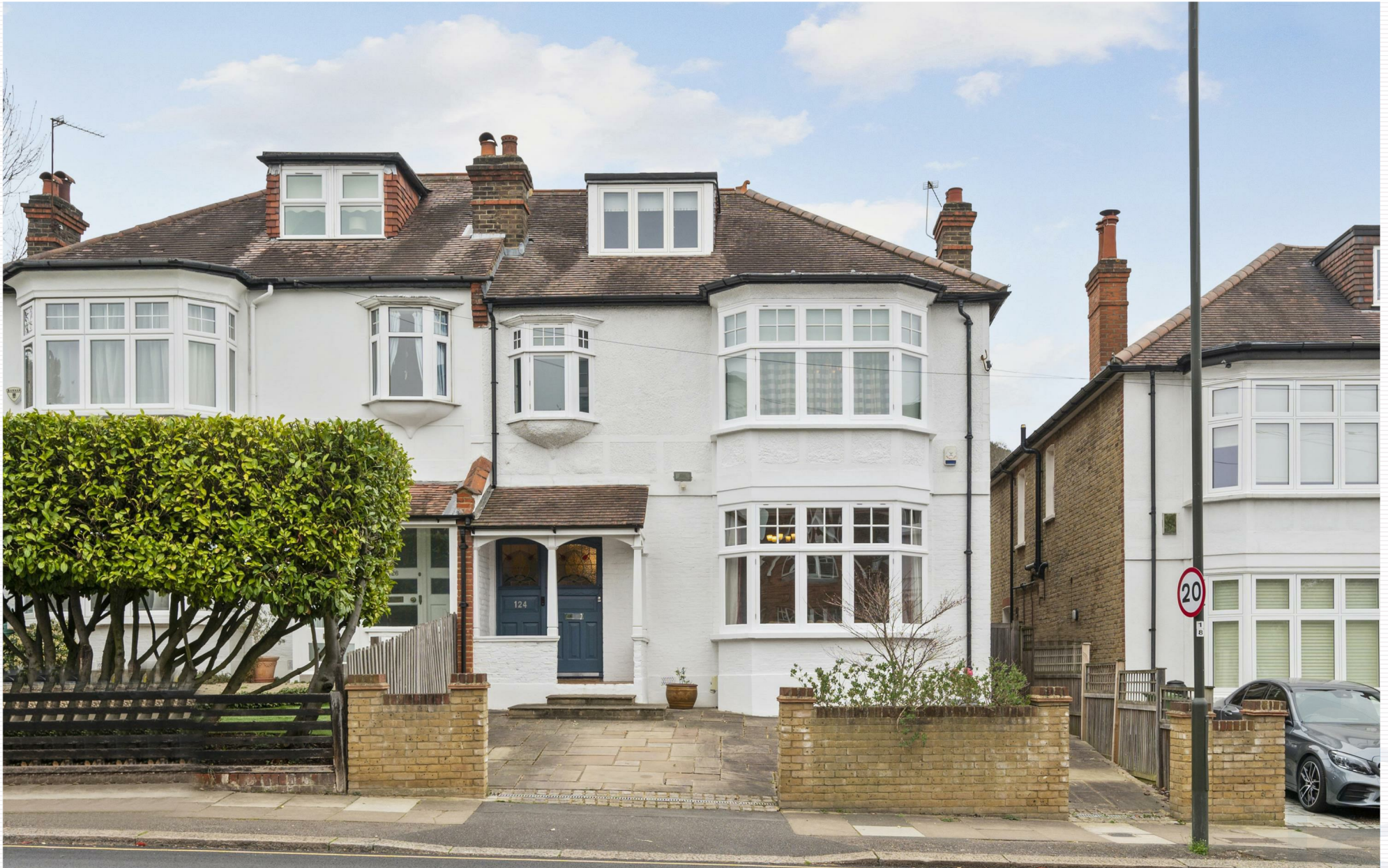
Pepys Road, West Wimbledon, SW20 8NY